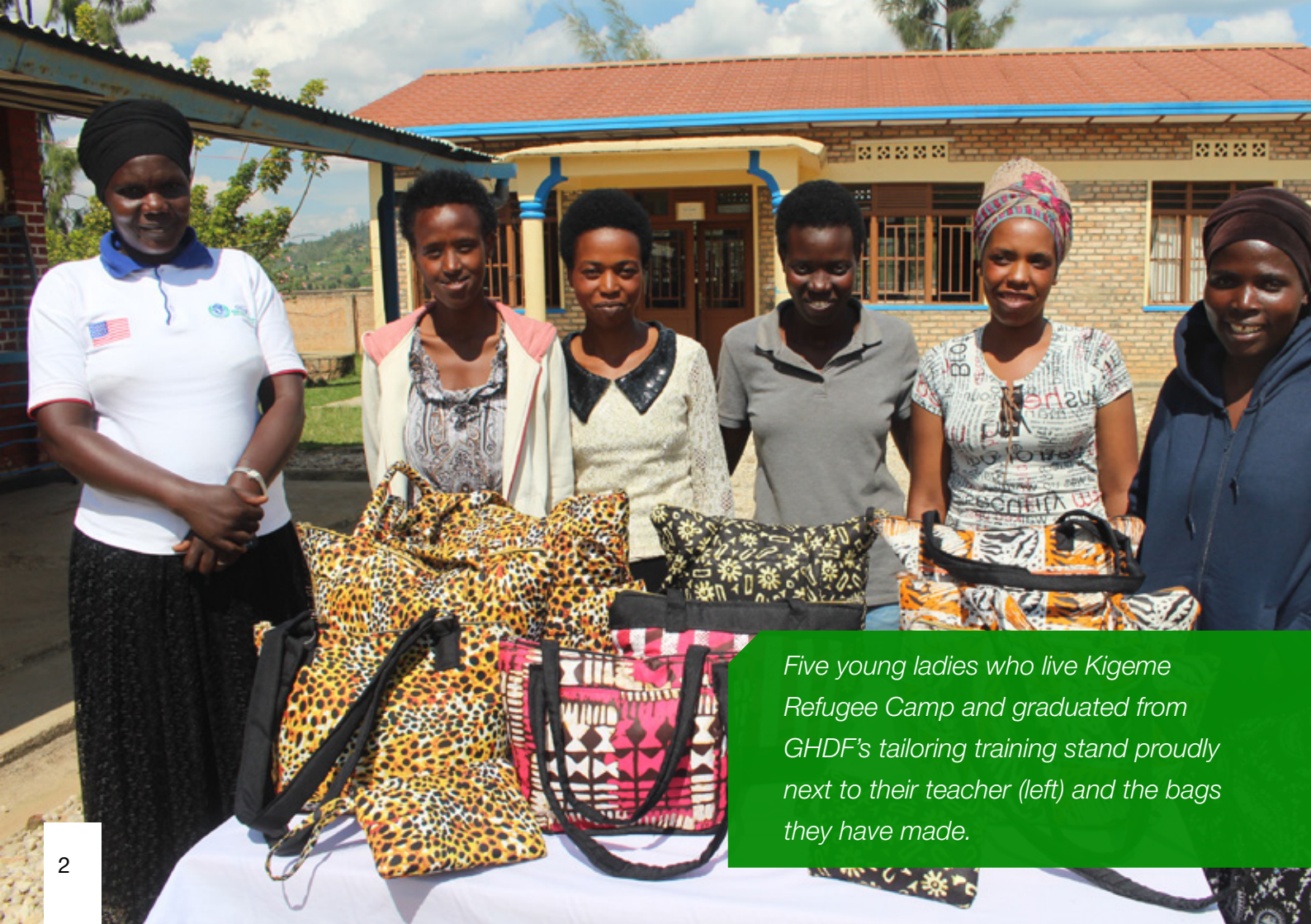
Five young ladies who live Kigeme Refugee Camp and graduated from GHDF's tailoring training stand proudly next to their teacher (left) and the bags they have made.